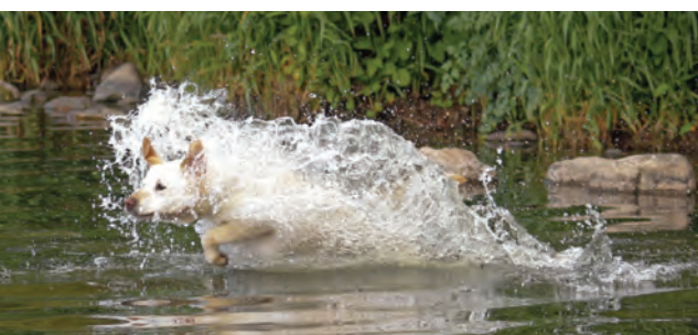
.(Above) Spectacular Gundog Action. (Below) The stand FISSTA was very popular.