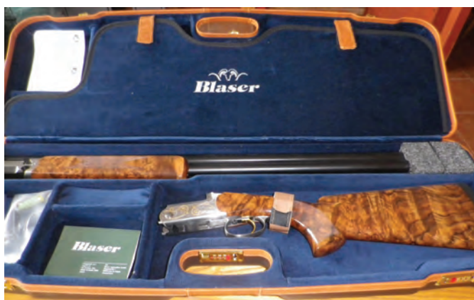
Blaser Custom 2 Shotgun