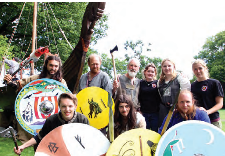
(Left) Vikings galore.