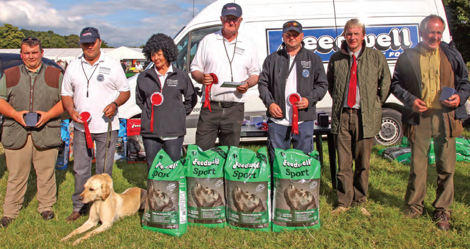
Top Gundog Team - Scotland - in the retriever international.