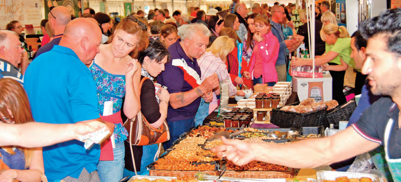
Crowds in the fine food pavilion.