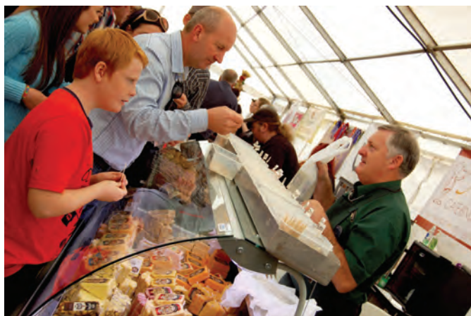
The Old Irish Creamery stand is always popular.

Making a welcome return are favourites such as Old Irish Creamery with their plain and flavoured cheddar cheeses; Crossogue Preserves jams, chutneys and curds; Forthill Farm's rare breed beef and pork; Tara Jams preserves and relishes; and Newrange Gold's rapeseed and camolina oils.