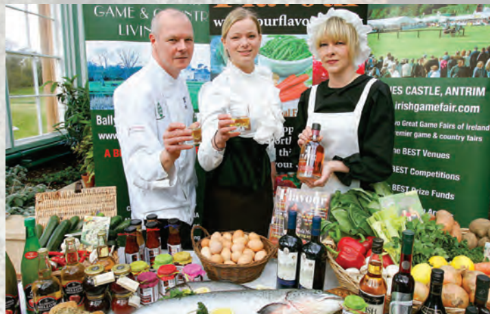
FINE FOOD FESTIVAL