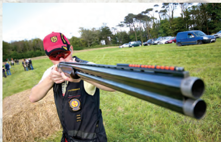
GREAT COUNTRYSports COMPETITIONS

23rd & 24th AUGUST, BIRR CASTLE, CO OFFALY