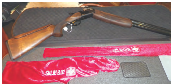
Comes with a smart case

It is available with either a vented mid rib barrel or a solid mid rib. The ATA SP Sporter comes with 5 chokes as standard and an elegant suede gun case. The stock and fore-end come in a beautiful red velvet sleeve.