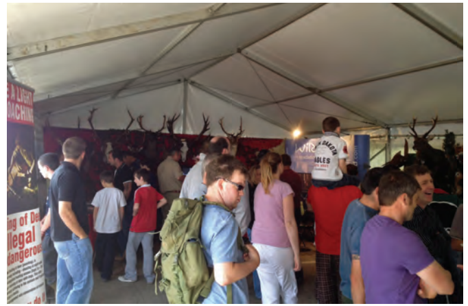
Huge interest at the busy WDAI stand.

You can visit the Wild Deer Association of Ireland stand in the Countryside Alliance Ireland marquee. They will have a large display of trophy deer heads along with discounted deer-stalking and butchery equipment for sale. Trained head measurers from the Irish Trophy Commission will also be on