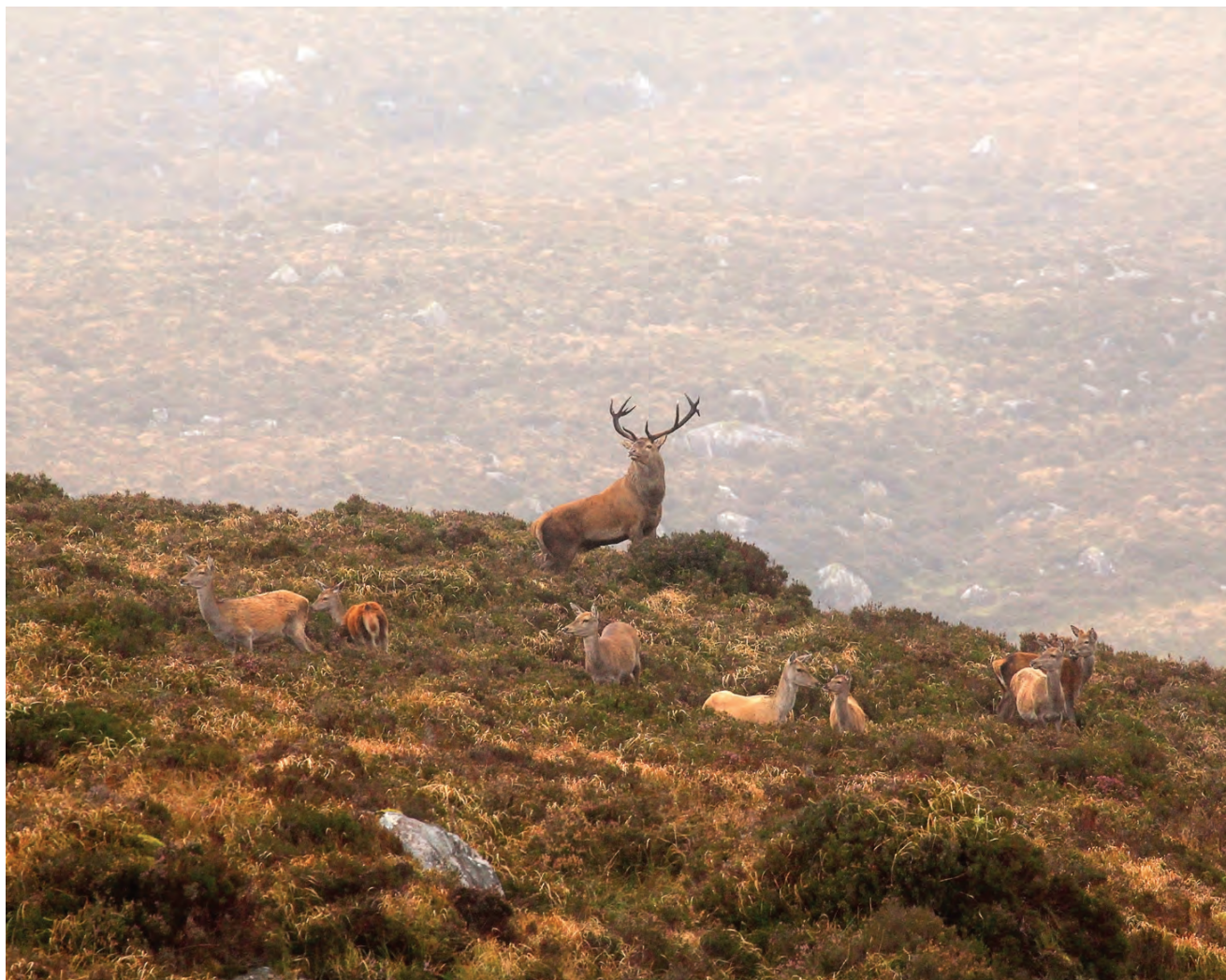
Kerry Mountain Red Stag

Ireland's national representative body for deer hunters, the Wild Deer Association of Ireland (WDAI), recently met with senior officials from the Department of Agriculture, Food and the Marine (DAFM) and the National Parks and Wildlife Service (NPWS) following claims by the Irish Farmers Association (IFA) that a major wild deer cull was urgently needed to combat bovine tuberculosis.