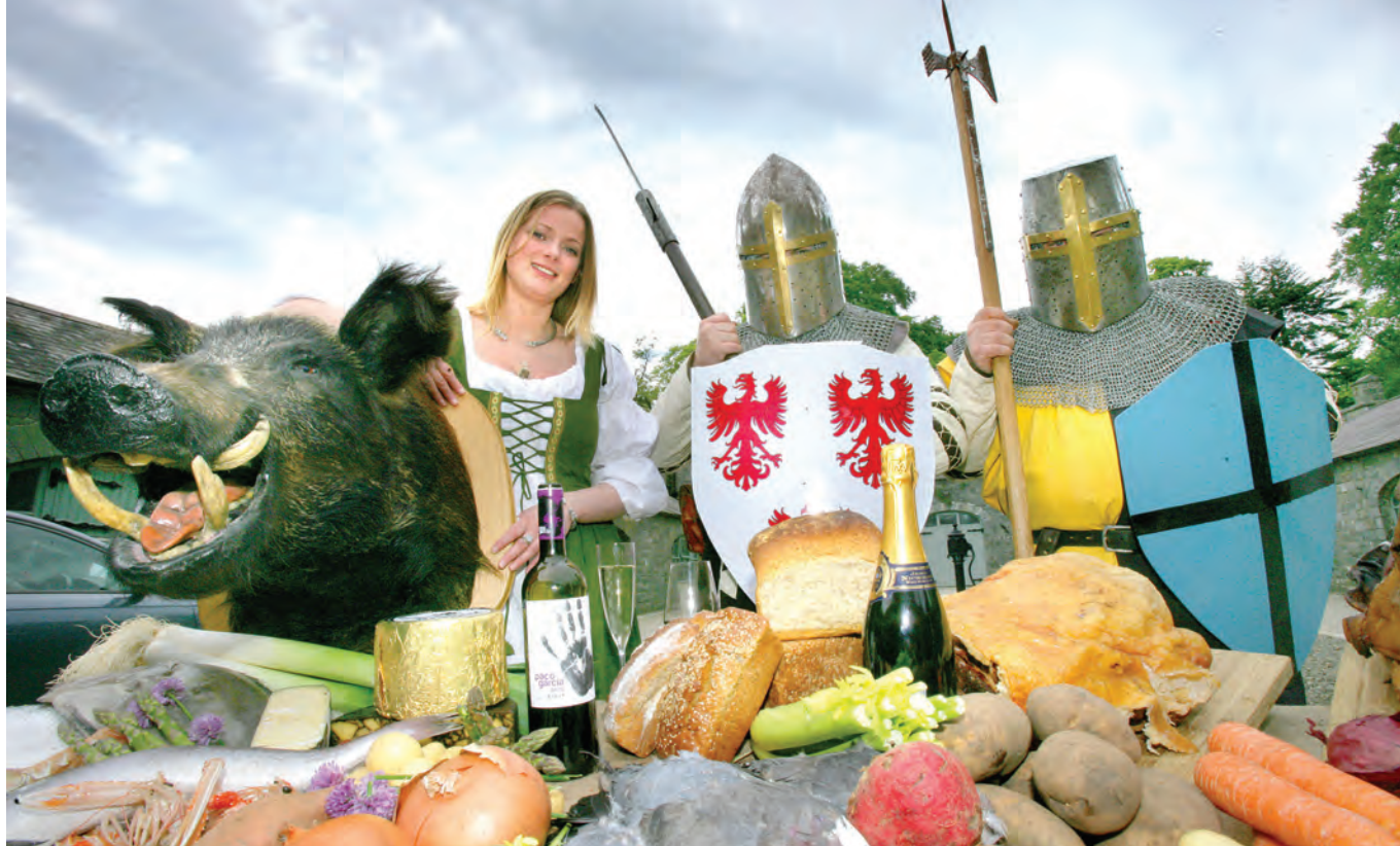
Medieval banqueting and fine food village are two key attractions.

each day. Admission charges are £30 for two adults or family (two adults and up to four children). Car parking and programme free and see the Autumn edition of Irish Countrysports and Country Life magazine (in the shops 8th September for an exclusive £10 discount voucher).