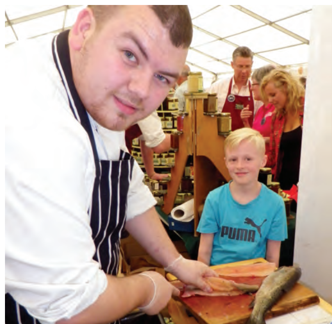
This budding angler learns the best way to cook his catch.

children this was their first time fishing and their smiles said it all. Nearly everyone left with a fish, parents were delighted and the NSN team found it to be a rewarding experience and would like to extend our thanks to all who helped and supported in any way."