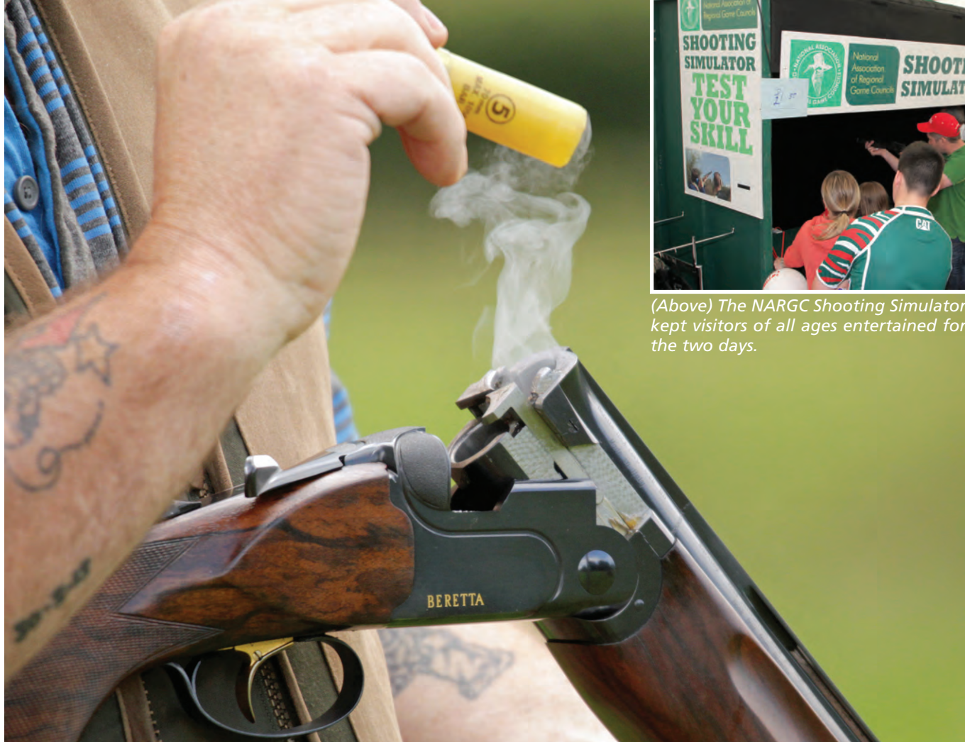
(Above) The NARGC Shooting Simulator kept visitors of all ages entertained for the two days.

in force. CAI, NARGC, FISSTA, UAF, NSN, APGAI Ireland, IWTF plus all manner of smaller campaigning organisations and conservation organisations such as RSPB, Woodland Trust, UWT, etc and SACS made their debut.