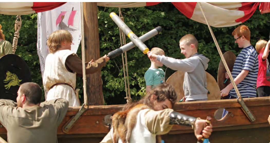
(Above left) Crowds of children took over the Viking longboat.