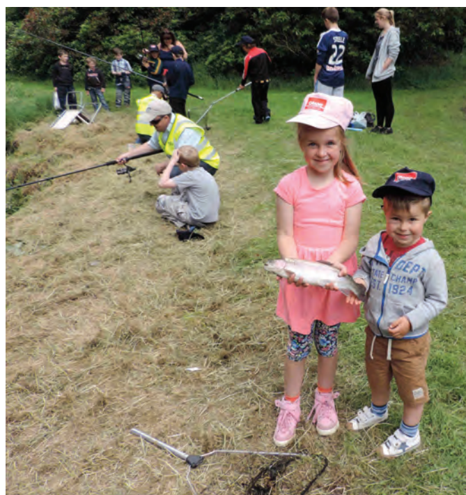
Scores of happy children got their first taste of fishing at Shanes Castle.