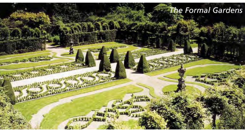
The Formal Gardens