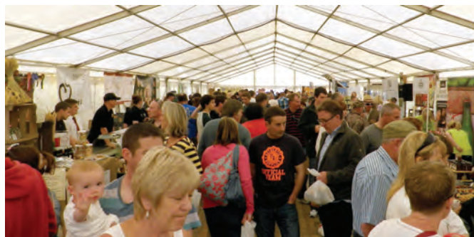
Crowded Food Hall.

Building on the success and popularity of the new Fine Food Festival at the Irish Game and Country Fair at Birr Castle in 2013, this year's pavilion promises to offer visitors an even more exciting line up of some of Ireland's finest food producers.