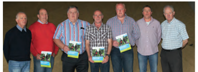
Members of the IFA Countryside Team.