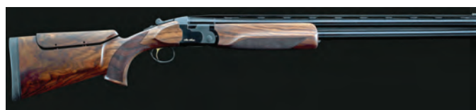
ATA Black Sporter

Wildhunter will be sponsoring an ATA SP Black Sporter with adjustable stock.