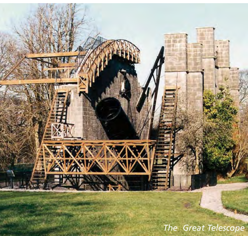
The Great Telescope