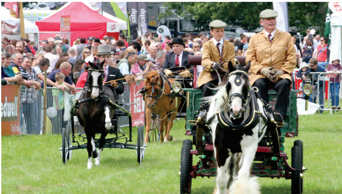
Traditional vehicles and modern crowds at Shanes Castle.