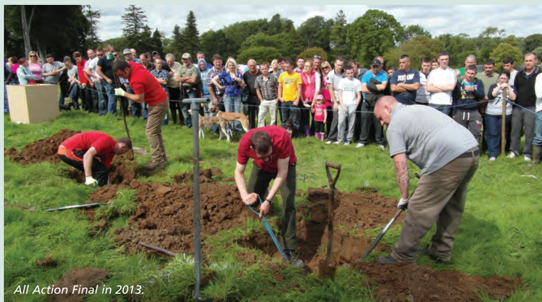
All Action Final in 2013.