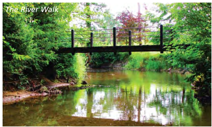
The River Walk